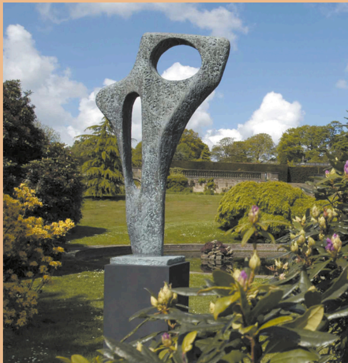
The Art of Barbara Hepworth